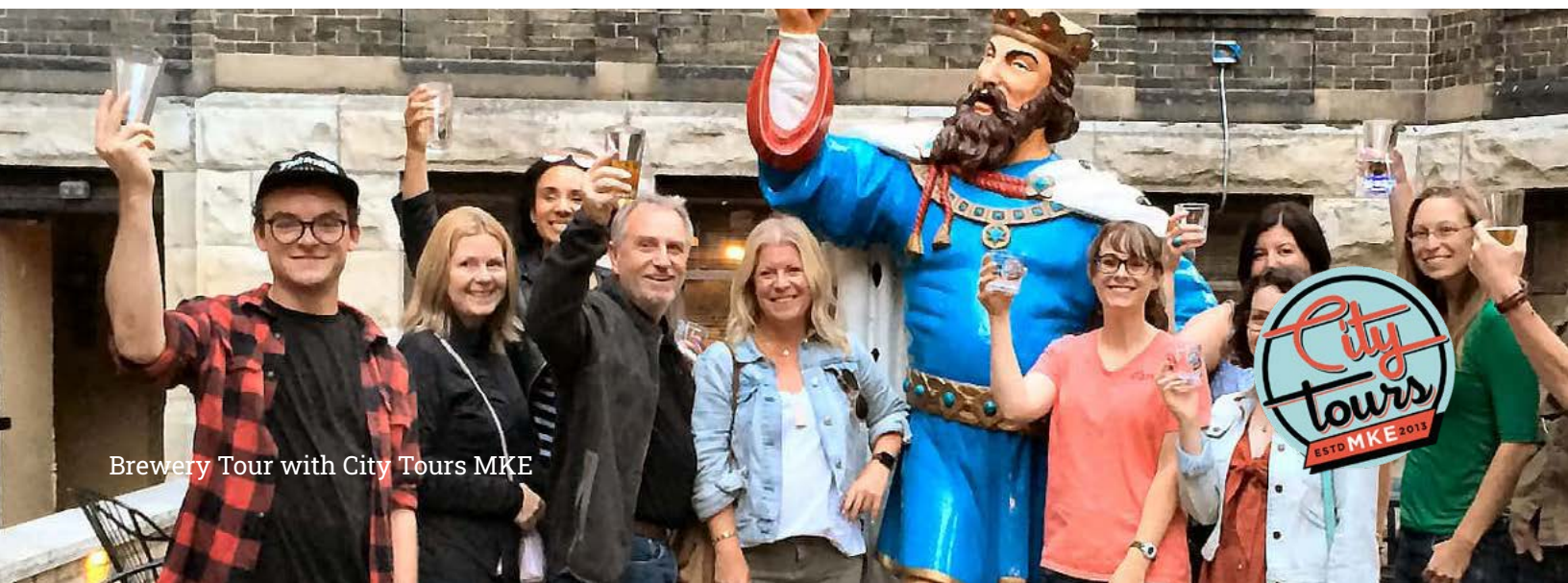
Brewery Tour with City Tours MKE