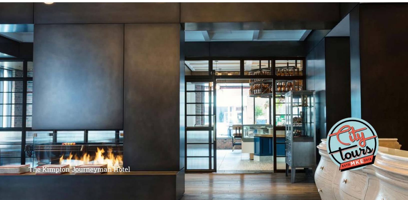
The Kimpton Journeyman Hotel